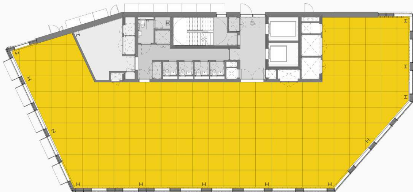
BUILDING B FIRST FLOOR