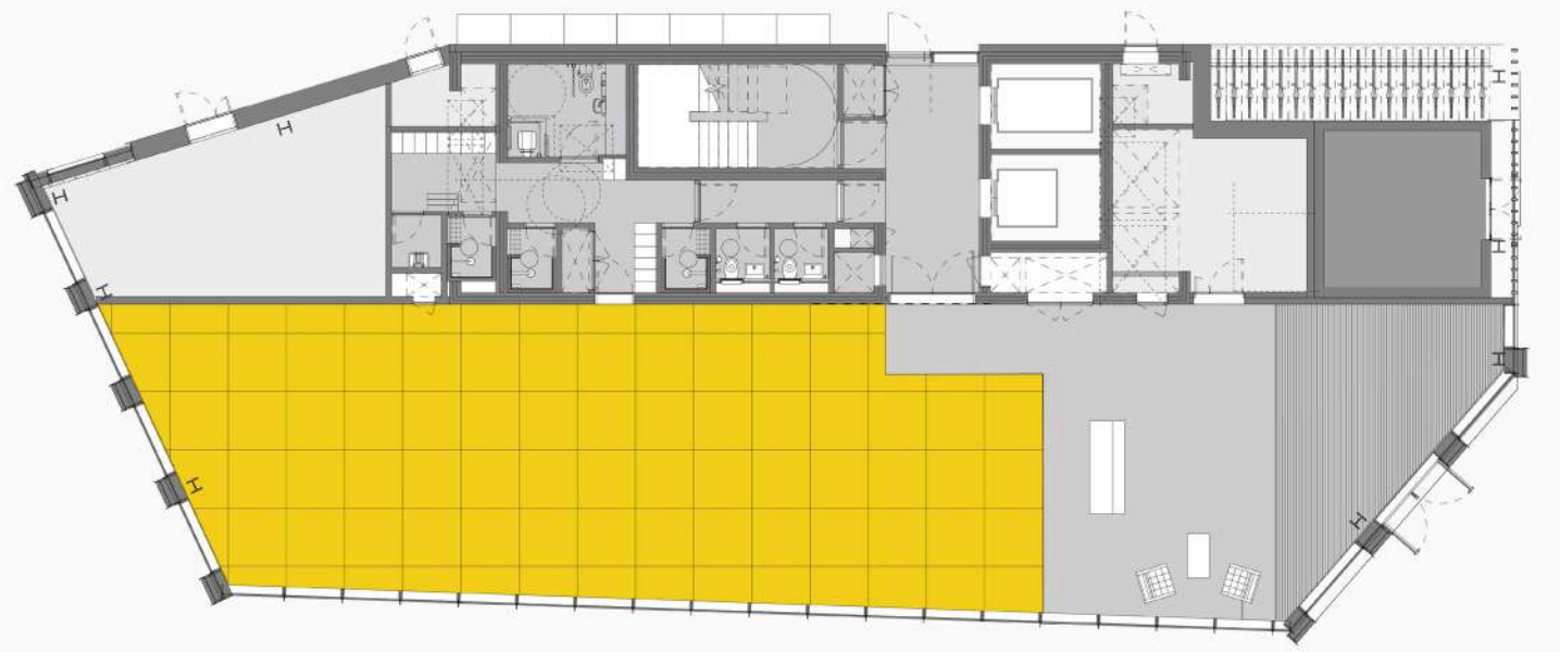
BUILDING B GROUND FLOOR