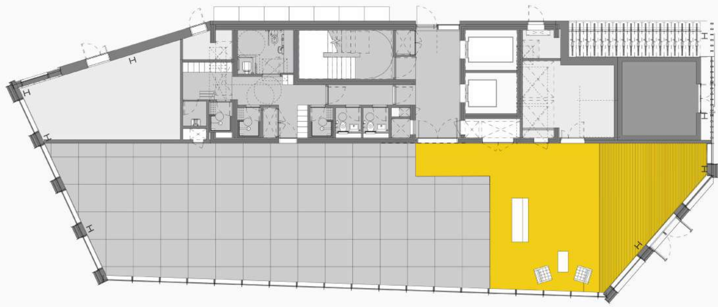
BUILDING B RECEPTION