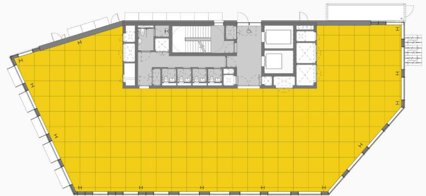
BUILDING B SECOND FLOOR